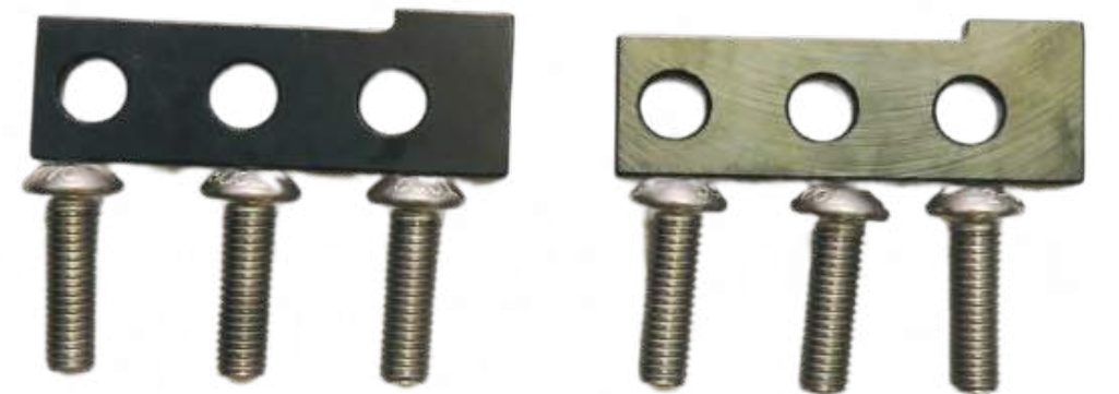
6 x mounting bolt