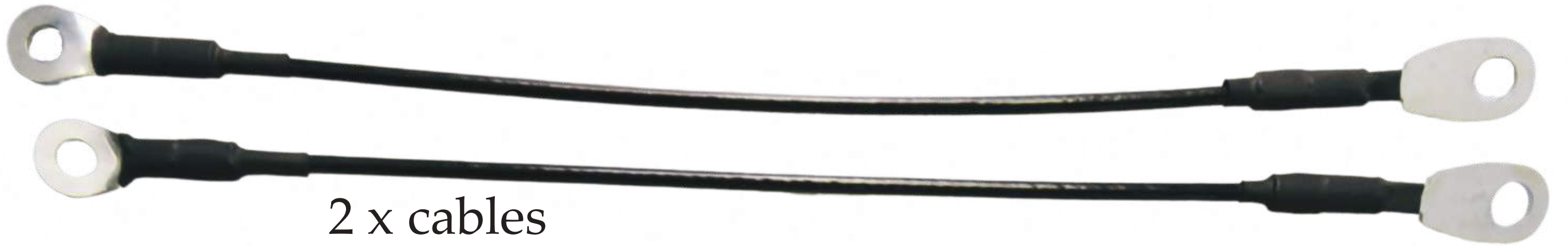
2 x cables