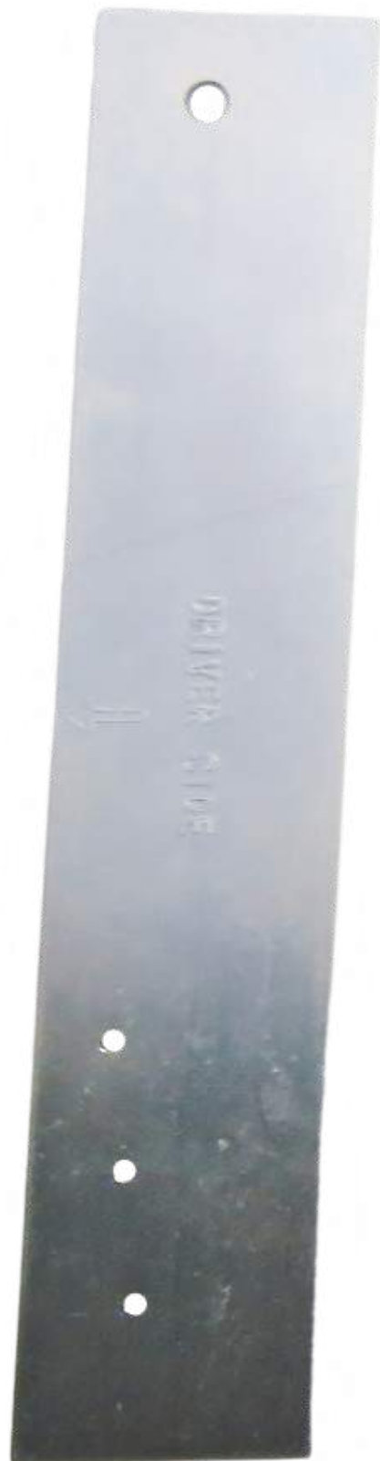
1 x drilling template