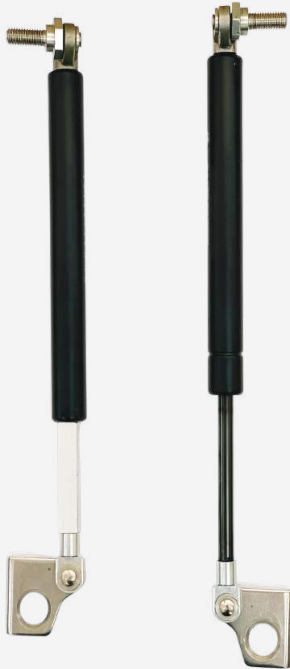
1 x easy up strut (passenger side)