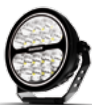
RDL6700LK 7" LED Driving Light 10-30V Round 74W Combination Beam