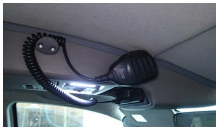
Left hand cable outlet radios