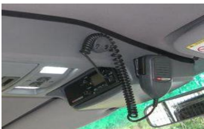
Microphone clip on slight angle

Install in a position that suits best, depending on vehicle and Radio model. Ensure microphone or microphone cable and holder does not foul on sun visor when pulled down.