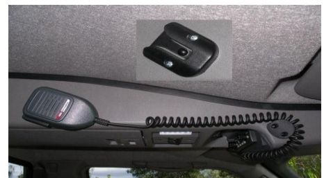
Microphone clip on acute angle