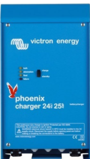
Phoenix Charger 24 V 25 A

To learn more about batteries and charging batteries, please refer to our book 'Energy Unlimited' (available free of charge from Victron Energy and downloadable from www.victronenergy.com ). For more information about adaptive charging please look under Technical Information on our website.