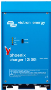
Phoenix Charger 12 V 30 A