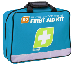
Portable grab and run soft pack case design with water resistant fabric backing