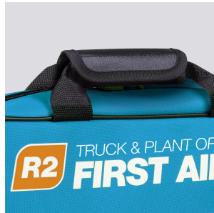
Portable grab and run soft pack case design with water resistant fabric backing