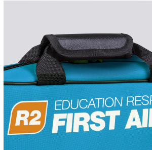
Portable grab and run soft pack case design with water resistant fabric backing