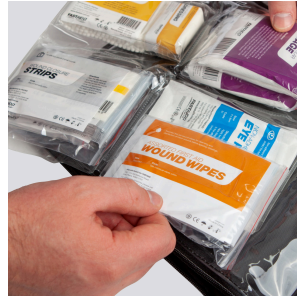
Colour coded contents to make locating the correct item fast and easy