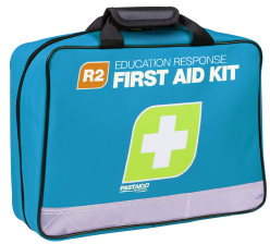
Portable grab and run soft pack case design with water resistant fabric backing