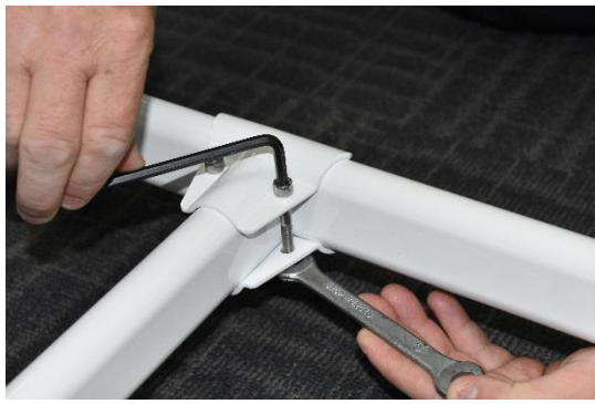
(Allen Key not provided)