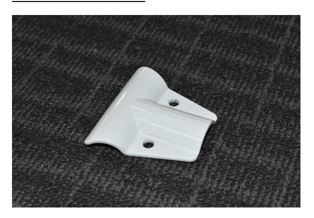
4 x Cross Bar Bracket Bolts + Nyloc Nuts